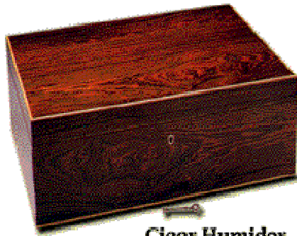
Cigar Humidor by Luke Hughes

Brazilian rosewood grows in the damp riverside areas of Brazil's tropical forests, in iron rich soil. The heart of the tree is prized for its rich, exciting deep red color. Rosewood has many fine characteristics. It is hard, shock resistant, flexible stable and strong. It is fairly easy to work, bend and glue; it machines and veneers well. It polishes to a high sheen due to its oily nature. It stands up to years of constant handling. Like many other tropical woods, it is so heavy the logs can hardly float in water. The single most desirable feature of rosewood is its exquisite color and its exotic patterning. The color ranges from deep purple black through dark chocolate red with ebony colored steaking. It has striking, wild, wavy markings, often mirror-imaged like a Rorschach blot test. Its unpredictable, irregular striped pattern makes it almost impossible to "match". This actually adds to its prestige and excitement.